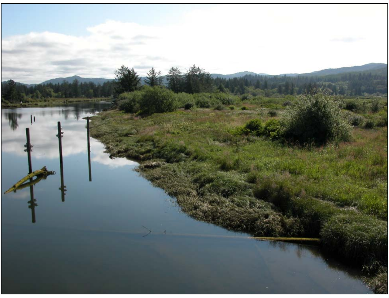
Tidal wetlands, North Fork Nehalem River.